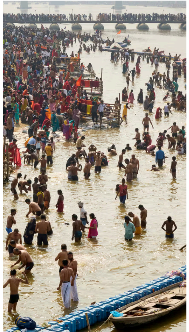
Pilgrims bathing on the banks of the River Ganges on Tuesday.